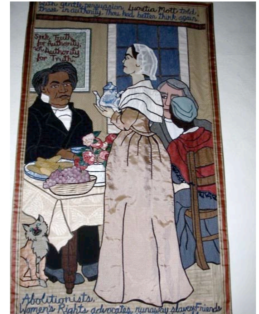
"Abolitionists, women's rights activists, runaway slaves, friends and family gathered at the Mott's table."

Inspired by the spiritual and religious diversity of our foremothers, who gathered together around the table to nourish body, soul and mind, we invoke our Seneca Falls heritage to move us forward together in promoting interfaith dialogue, cooperation and peace.