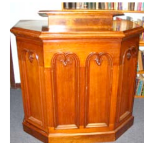
The pulpit where Elizabeth Cady Stanton stood in 1848 is owned by the Institute.